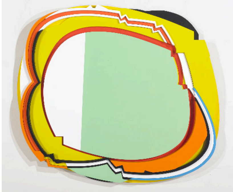
David Ryan, Left on Pan Am Fwy , acrylic on MDF, 2010, 30-1/2 x 37 x 3 inches.

transcend their lowly material in an exploration of color, form, line and shape.