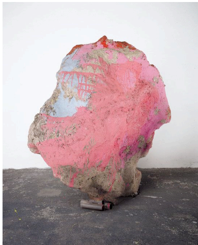
papier-mâché, styrofoam, cardboard, lacquer & acrylic 68-1/2 x 59-3/4 x 44 inches

Contact: David Marshall - david@jameskelly.com