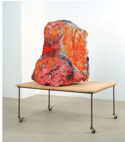
papier-mâché, plaster, gauze, paint, metal & wood on wheels 37-1/4 x 46-1/2 x 35-1/2 inches

James Kelly Contemporary is pleased to announce the upcoming exhibition of Austrian sculptor and collage artist Franz West. Among the works on display are recent papier-mâché sculptures, painted-over collages, metal furniture and half a dozen sculptures called paßstücke , which will be on loan, to SITE Santa Fe for inclusion in Disparities and Deformations . This is the first exhibition of these works in the United States.