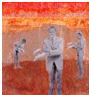
collage & oil paint on canvas 55-1/2 x 52-1/2 inches

"Early on I realized that the purely visual experience of an artwork was somehow insufficient. I wanted to go beyond the purely optical and include tactile qualities as well. My works aren't things one just looks at, but things that the viewer is invited to handle. There have been many theories of art that try to break down the border between art and the world, but I don't find such attempts to be particularly meaningful. Art remains art. I really see my work as quite compatible with the l'art pour l'art philosophy. One may think that I try to bring the art object out into the world since my works sometimes appear to have a practical function, but really it's the other way around: things in the world can, under certain special circumstances, enter the realm of art. And, in fact, once they have entered this realm they are art." -Franz West