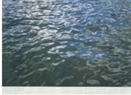
Still Water (The River Thames, for Example) - Image L , 1999. Offset lithograph (photograph and text combined) on uncoated paper. 30 ½ x 41 ½".

James Kelly Contemporary is located at 1601 Paseo de Peralta, Santa Fe, NM 87501. Gallery hours for the duration of this show are Tuesday through Friday from 10:00-5:00 p.m. - Saturday from 12:00-5:00 p.m. - Monday by appointment. Please call the gallery at 505.989.1601 - fax 505.989.5005 - email hannah@jameskelly.com for more information.